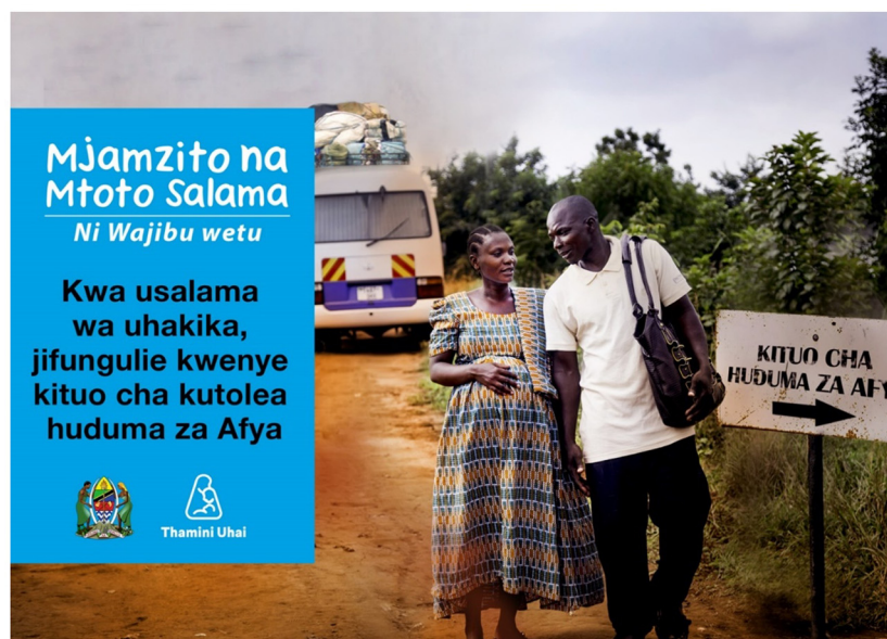
A family planning campaign poster shows a supportive partner escorting a pregnant woman at term to a health facility for delivery and states: “For safety and reliability, please deliver in a health care facility.”

The second programmatic enhancement emerged through a new funding commitment made by Bloomberg Philanthropies to support FP globally. Incorporating FP services was logical given the large unmet need for modern contraceptives and the estimate that eliminating this need could reduce the annual global number of maternal deaths by an additional 27%. 43 The Program supported FP outreach education and distribution services (e.g., FP weeks, service days, integrated FP service delivery) in communities; it also strengthened the provision of high-quality FP services by working with the R/CHMTs to integrate FP into routine services and to expand method choices. This approach ensured that the Program was able to increase demand for FP services while meeting the need of more clients in multiple locations. The Program also strengthened the R/CHMT’s overall capacity to manage FP services through