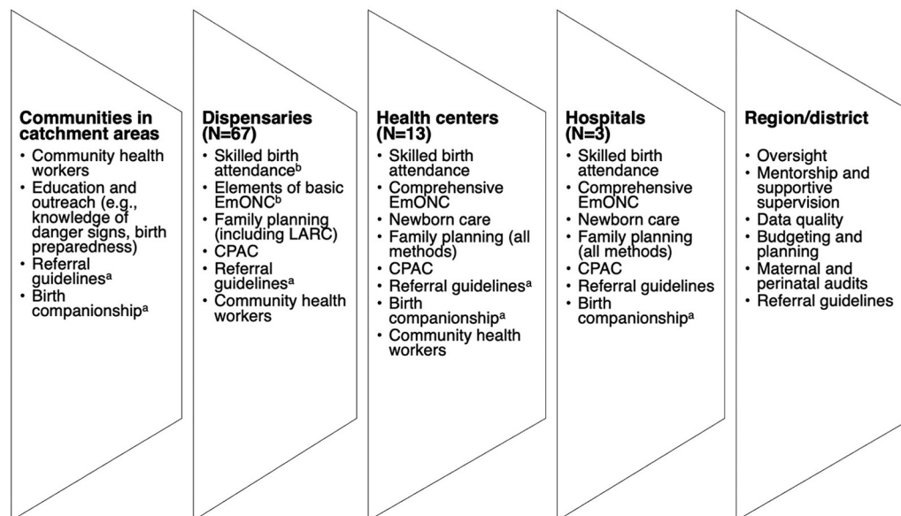
FIGURE 2. Snapshot of Major Program-Supported Interventions by Level of Health System

Abbreviations: CPAC, comprehensive postabortion care; EmONC, emergency obstetric and newborn care; LARC, long-acting reversible contraceptive.